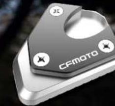
ENLARGED SIDE SUPPORT PEDESTAL