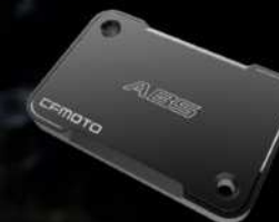
BRAKE CLUTCH OIL CUP COVER