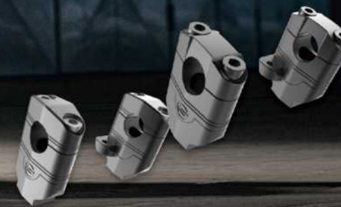
HANDLEBAR HEIGHTENING BLOCK