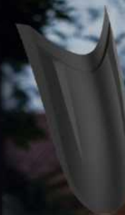
FRONT LENGTHENED FENDER