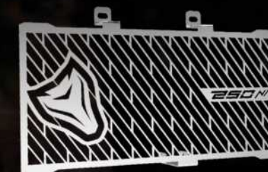
RADIATOR PROTECT NET