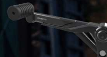
ADJUSTABLE SHIFT ROD